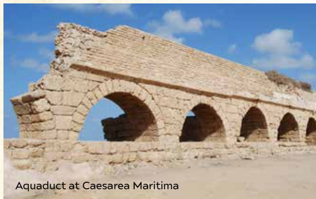
Aquaduct at Caesarea Maritima

Today, we will go to the lowest place on earth, the Dead Sea. As we travel along the way, we will visit Beth-shean, the Spring of Harod, and Jezreel. We will be able to see the Hill of Moreh where Gideon attacked the Midianites, Mount Tabor where Deborah and Barak fought against Sisera, and Mount Gilboa where Saul died. After lunch in Jericho, we will travel to our overnight destination on the shores of the Dead Sea. That evening, you will have the opportunity to float in the Dead Sea.