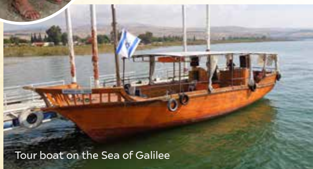
Tour boat on the Sea of Galilee