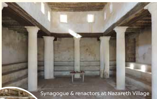
Synagogue & renaactors at Nazareth Village